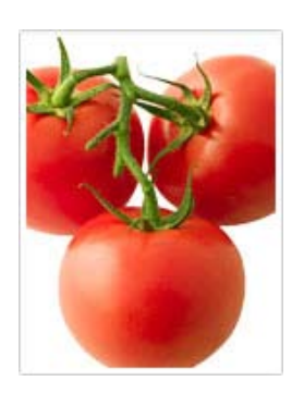
Canning and Agri-food