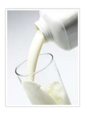
Milk and Dairy