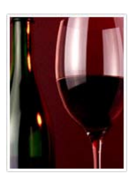
Wine and Oil