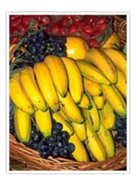
Fruits and Vegetables