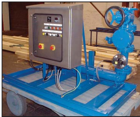
Skid mounted package comprising pump, gearbox, control panel, baseplate and suction and delivery pipework connections

To meet the requirements of your installation, bespoke packages can be supplied. These are designed on the 'Plug and Play' principle, normally requiring only final pipe and electrical connections to be made on site, helping to reduce installation costs.