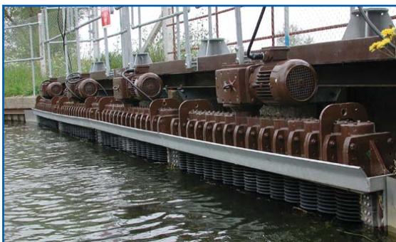
4 Discreens supplied and installed on a lagoon intake

Mono has completed a number of projects throughout the U.K. comprising 3D design, supply, installation and commissioning of Discreens for river intakes. The combination of the effective self-cleaning Discreen and our experience in managing the installation, offers a complete solution for river intake screening projects.