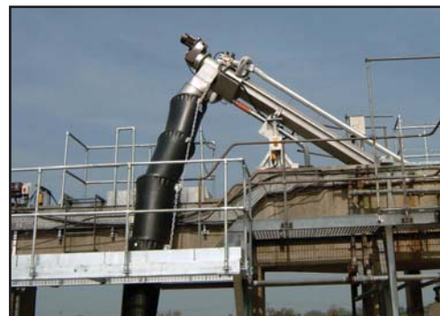
Screw Conveyor installation at a local treatment works

Whether you need to replace an old pump station or install a new packaged pumping system, the Projects Team can design and install equipment to effectively pump raw sewage over long distances to the local treatment works. Demolition of old pump houses and new installations have all been undertaken at competitive prices with minimal disruption to local residents.