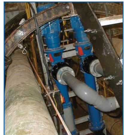
Vertical pumps installed in a 47m deep tunnel

Installations at industrial plants have included £100,000 mechanical and electrical installation for groundwater pumps; heavy duty vertical pumps with 250kg swing jib and fully automated tanker loading pumping systems.