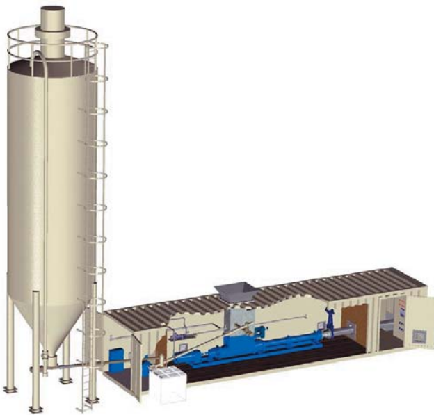
A packaged sludge treatment plant designed by Mono

'Just one company to design, supply and install'