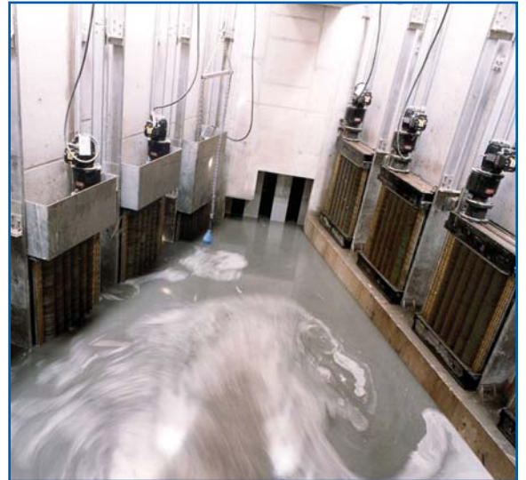
Installation of nine Discreens and two Munchers, together with a guide rail system for easy removal from the 7 metre deep storm chamber

Mono is approved by all Water Plc's and major Civil Contractors, along with many 'Blue Chip' manufacturing companies.