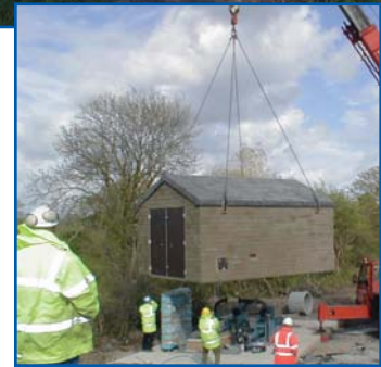
The management of craneage for a contract to install a special acoustic GRP kiosk and sewage pumps