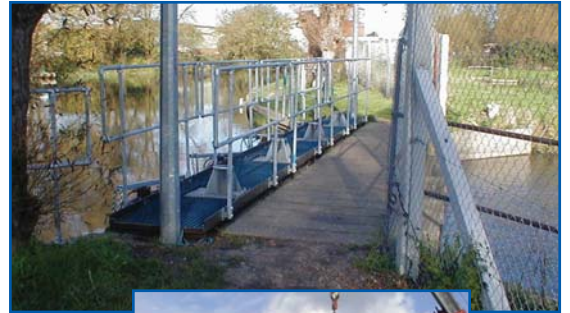
A walkway installed as part of a river intake contract