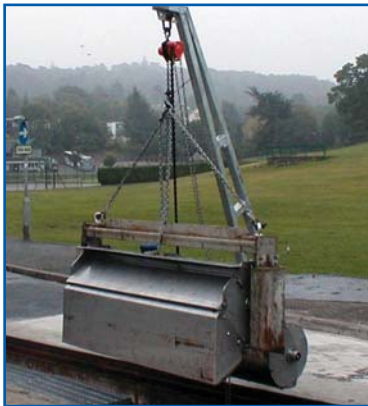
Lifting chain management system for a Mono Stormscreen

Stormscreens have been installed as simple retrofits into existing storm overflow chambers or new works designs. When located under a main road, a simple guide rail and lifting chain management system has been utilised to allow quick and easy installation and removal.