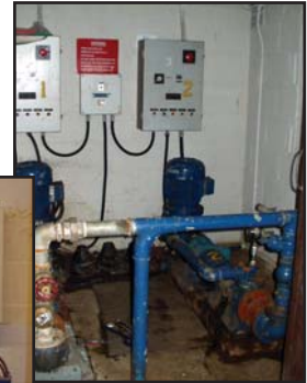
Refurbishment of an old pump station, complete with new interconnecting pipework and control panels