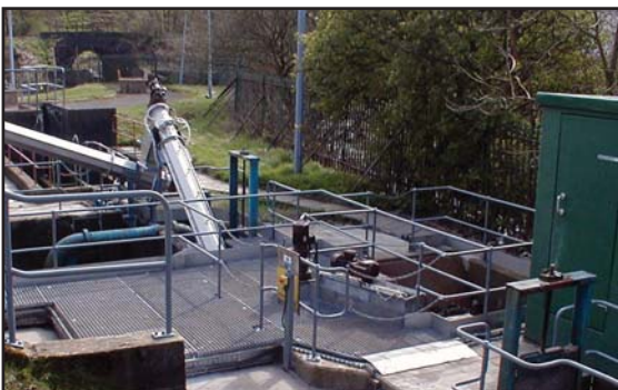
Extractor, screen and macerator installation

For projects that require complete extraction of screenings, Mono has undertaken a number of contracts comprising Discreens, extractors and screw conveyors. Working closely with the customer on design and build, Mono's single source supply and installation reduces time and cost, compared to the involvement of third party contractors.